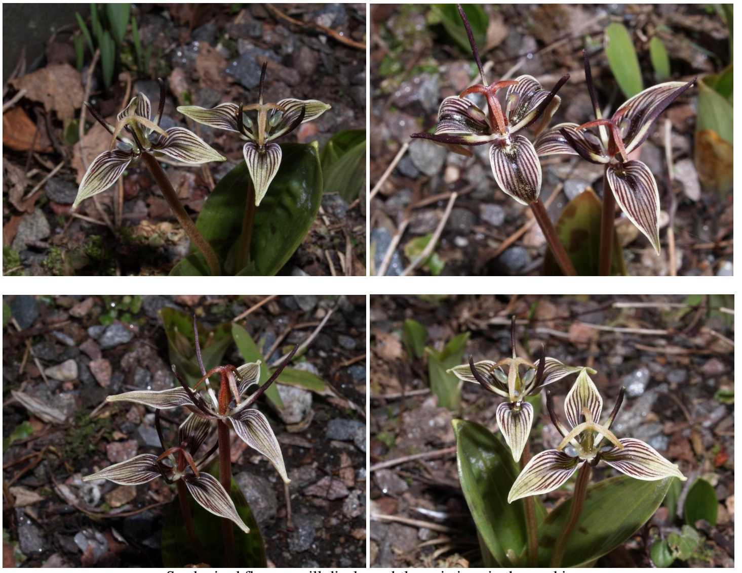
Seed raised flowers will display subtle variations in the markings.