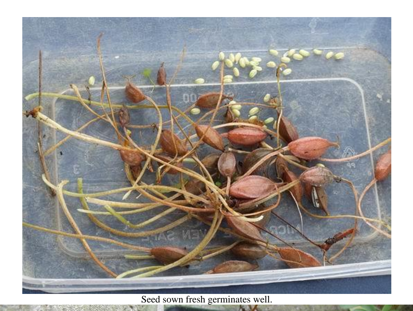
First flowers come three years after germination.