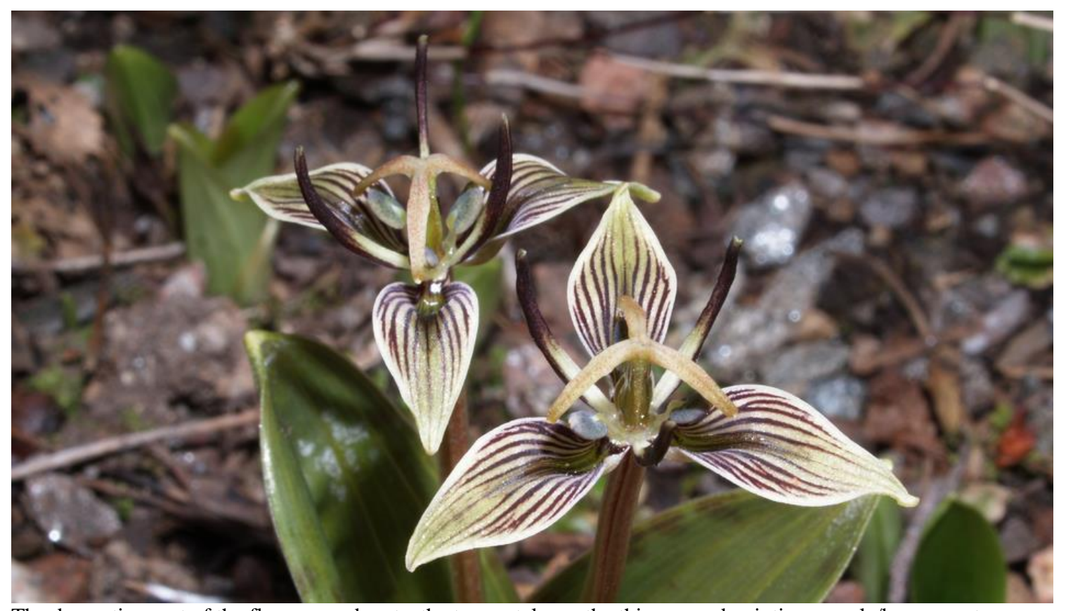
The decorative part of the flowers are bracts, the true petals are the thin upward pointing purple/brown parts.