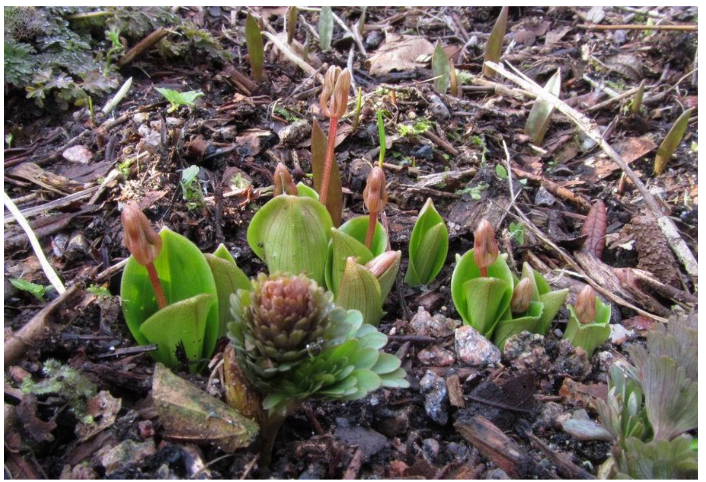
Both species grow well in the open garden but you do have to choose a suitable spot that allows their subtle charms and diminutive size to be appreciated.