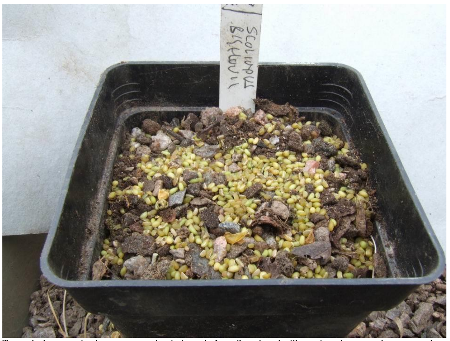
To get the best germination we sow seed as it ripens in June. Stored seed will germinate but may take a year to do so.