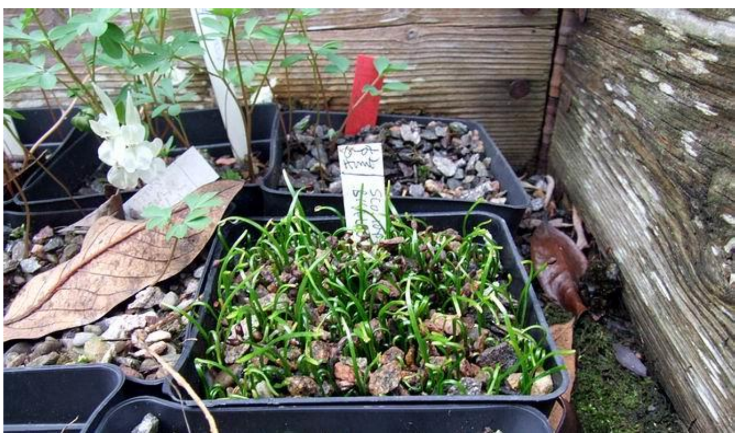
Seed sown fresh germinates well early in the year. Stored seed may give a sporadic germination over a few years.