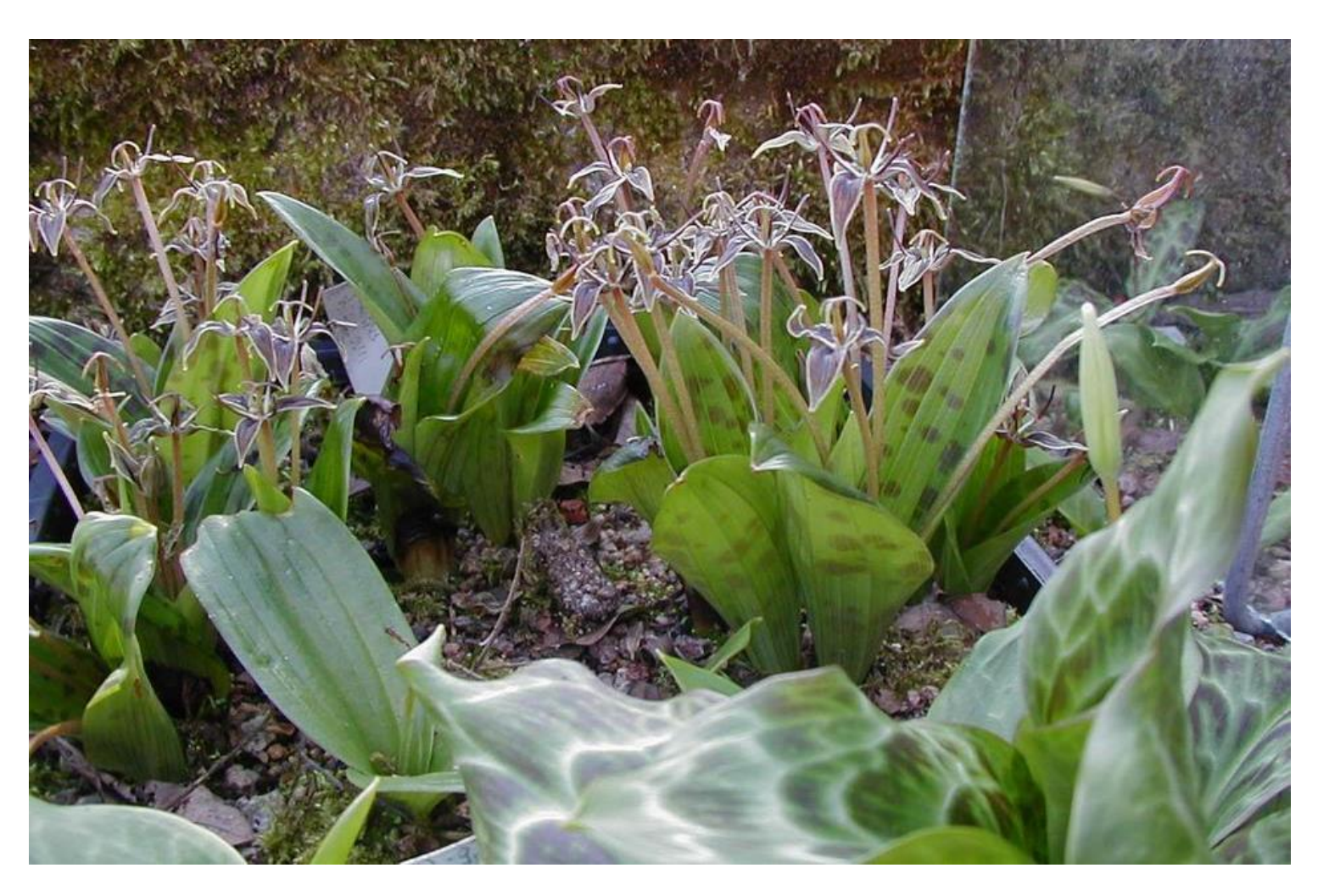
Scoliopus is unlikely to stop most people in their tracks as they walk around the garden but the subtle beauty will reward closer inspection. The flowers have a rather 'wet dog' scent.