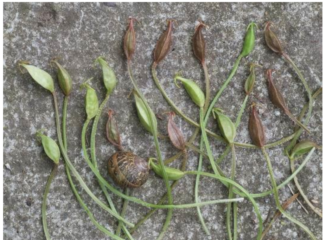
The main pests are slugs and snails that eat all parts and seem especially attracted to ripe seed capsules.