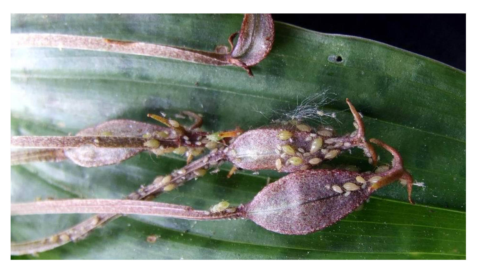
Aphids are also attracted to the plants and again seem especially interested in the juicy fat seed capsules.